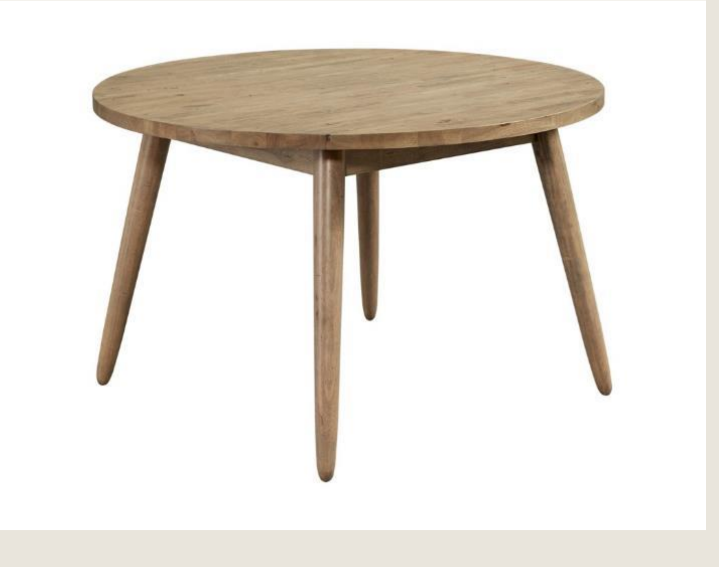
< Round table design with modern chair>